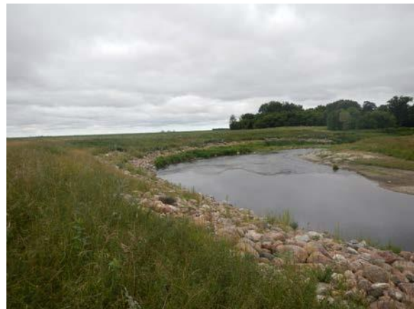
Before and After Pictures of a Streambank Stabilization Project on the South Branch Two Rivers