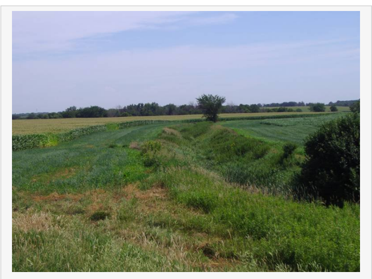
An established grass filter strip along a county ditch