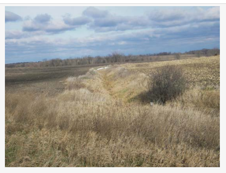
A county ditch in need of a grass filter strip