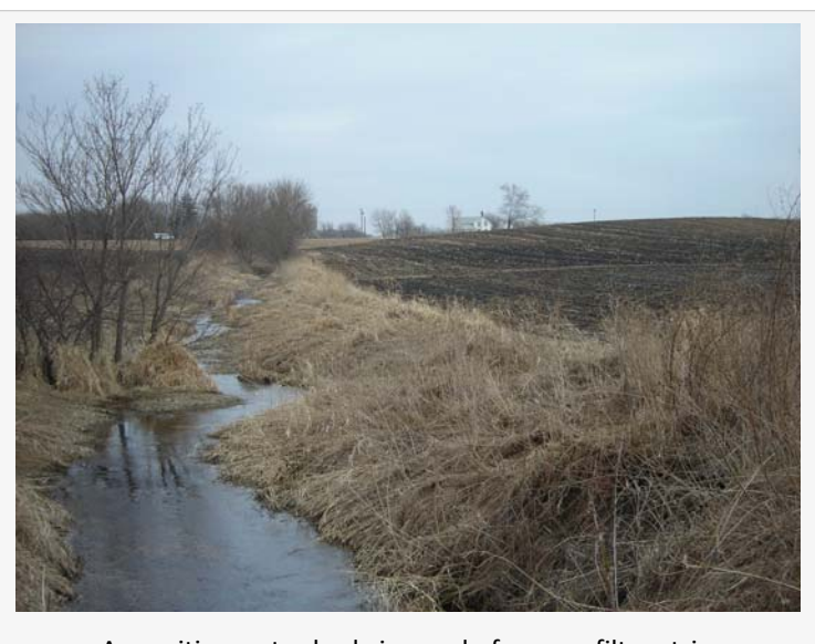
A sensitive water body in need of a grass filter strip