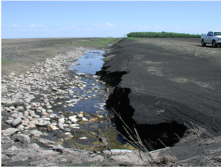
Sedimentation in Kittson County Ditch 26